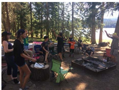
Middle Schoolers gathering for song . . .

Middle School Camp @ Howard Prairie July 12-15