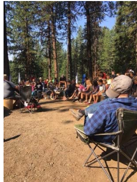
Morning Worship at Kid's Camp under blue skies

Kids Camp @ Wilderness Trails July 19-22